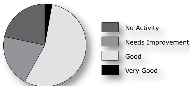
Compliance Audits 2012

In addition to the activities above, the Commission auditors completed an additional eight audits resulting from a change of broker, a brokerage closing, or a spot audit.